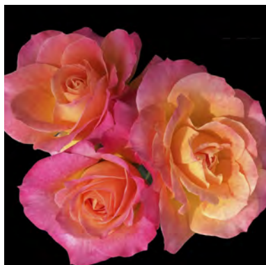
2013 Joyce Abounding