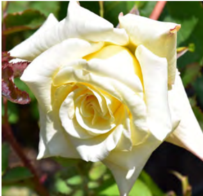
Moonstone X Honey Dijon