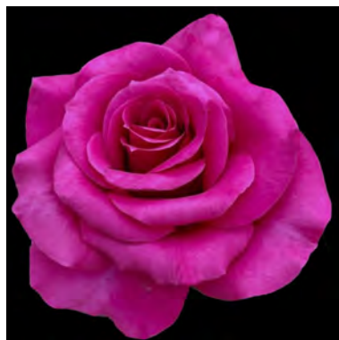
2014 Flemington Racecourse