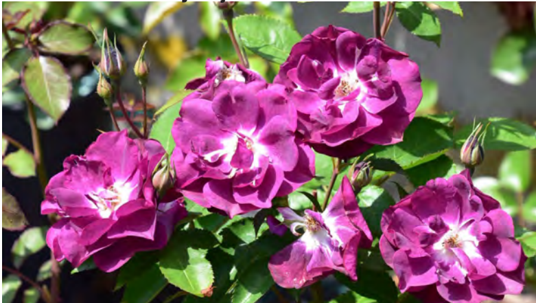
Lavender Ponocchio X Ebb Tide