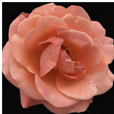
2016 China Sunrise