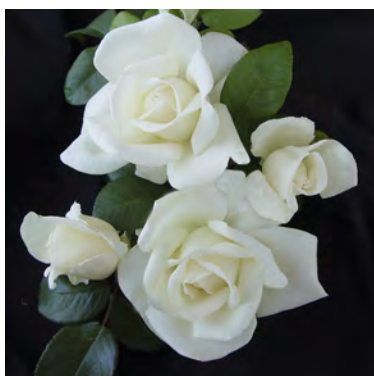
2018 Amazing Grace