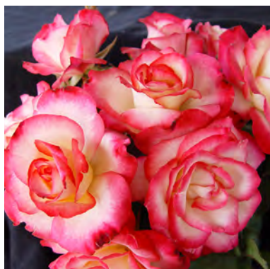
2017 Love's Gift